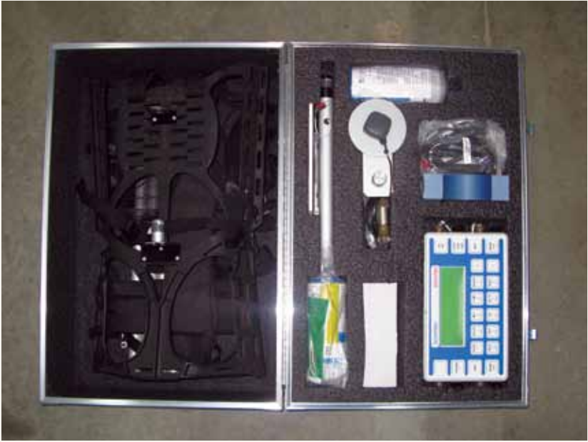
■ Envi Pro system package